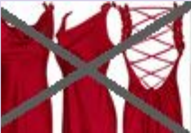
Too low cut (back)