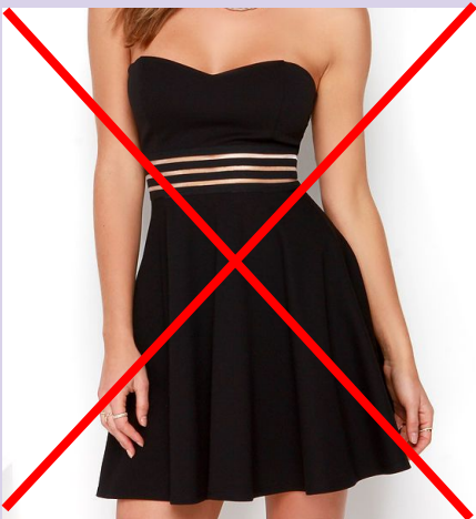
Must have straps!

Be aware of the length, front cut, and back cut of dresses!