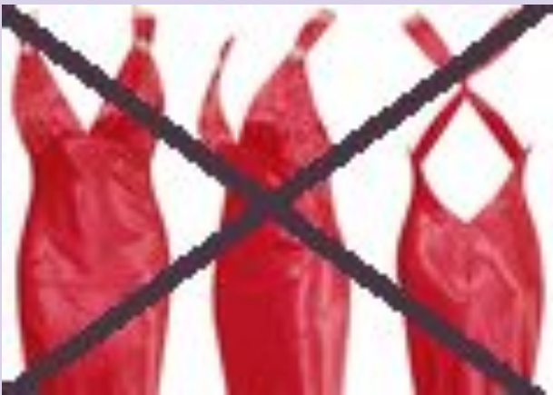
Too low cut (front and back)